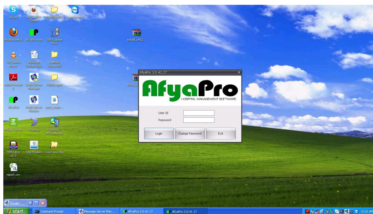
Figure 1. Login Window (above) and User Interface (below) of AfyaPro.